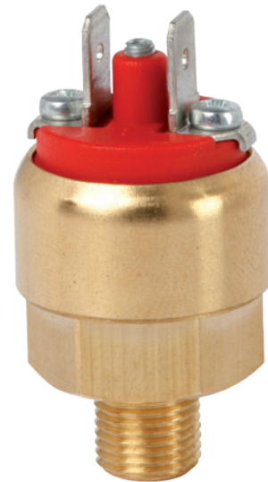
OEM compact pressure switch, miniature format, brass design, model PSM05