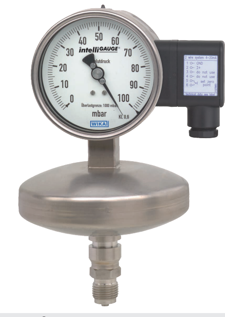
intelliGAUGE® model APGT43