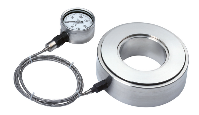
Hydraulic ring force transducer, model F6154