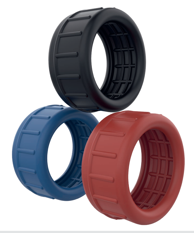
Case protector model 910.18