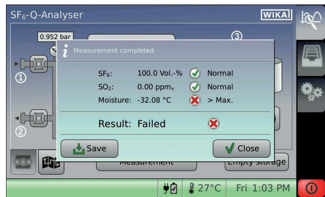
Measured value display

The GA11 makes it quick and easy to import a measuring point list, edited on a PC. Due to the complexity of the measurement task, specific knowledge is a pre-requisite, see IEC 62271-4:2013, ASTM D2029-97:2017 and CIGRÉ - SF 6 Measurement guide (723).