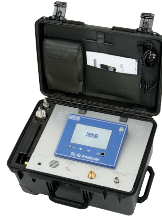
Analytic instrument model GA11